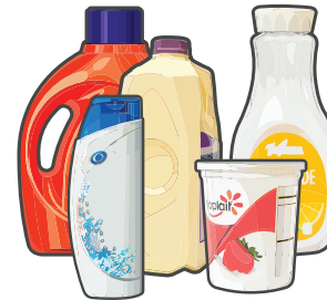
Plastic Bottles, Jars and Jugs (empty and dry)