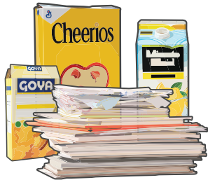
Paper and Cartons (all colors and types)