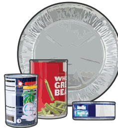
Metal Cans (empty and dry)