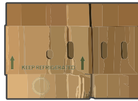
Cardboard (empty and dry)