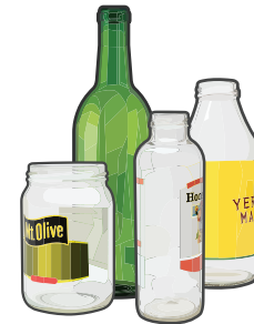
Glass Bottles and Jars (empty and dry)